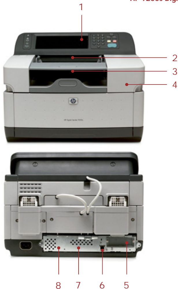
HP 9200c Digital Sender (Q5916A)